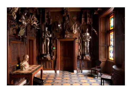
Abbotsford Entrance Hall

Created almost 200 years ago on the banks of the River Tweed in the Scottish Borders, <u>Abbotsford</u> was the culmination of Sir Walter Scott's creative ambitions as a writer and the fount of his inspiration. On our guided tour of Scott's Romantic baronial estate you will discover a treasure trove of intriguing objects and unusual artefacts which inspired Scott's greatest poems and novels. The lush gardens remain much as Scott designed them. We will also enjoy lunch together in the Ochiltree Café.