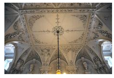
Arniston House Main Hall

This evening will be one of the highlights of our trip as you live like a king or queen when we dine in the State Dining Room aboard the Royal Yacht Britannia . Upon our arrival we will be treated to a reception with Champagne and canapés created by Britannia's Executive Chef in the Royal Galley. Prior to our four-course dinner, we will see highlights of The Royal Yacht Britannia. This captivating guided tour is an insight into how the Royal Family and crew lived and worked on board. BLD