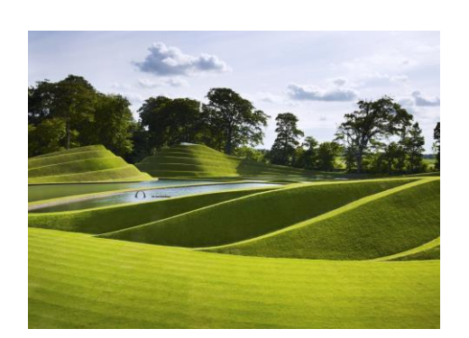
Cells of Life, Charles Jencks 2005. Photo: Allan Pollok-Morris. Courtesy Jupiter Artland

You will arrive at the Edinburgh Airport where we will be met by our private motor coach at 9:15 AM to be taken to Jupiter Artland, a contemporary sculpture park on 100 acres surrounding a Jacobean mansion. Visit their website (https://www.jupiterartland.org) for a complete list of artists. There we will enjoy lunch following our tour of the collection. Next, we'll travel to the Royal Botanic Garden for a tour of their 70 acre grounds which are world renowned for horticultural excellence. The first of many afternoon teas follows our tour. Your luggage will be delivered to our hotel and will be waiting when we arrive. Dinner is on your own.