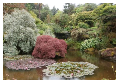
Gardens at Mount Stuart

On this our final full day in Scotland, we will travel by coach and ferry to the Isle of Bute to visit Mount Stuart. The spirit of 19<sup>th</sup>-century invention is embodied in Mount Stuart – a feat of Victorian engineering, this neogothic mansion was one of the most technologically advanced houses of its age. Ironic, when you consider the medieval inspiration of the Gothic Revival. Set in 300 acres of grounds which include designed gardens, woodland, and coast, there is something for everyone. We will be greeted by refreshments when we arrive, followed by a tour of the house and the Bute family's collections, and afternoon tea served in a private sitting room. There will be time to visit the garden and grounds