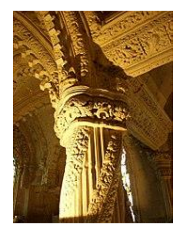
Apprentice Pillar, Rosslyn Chapel