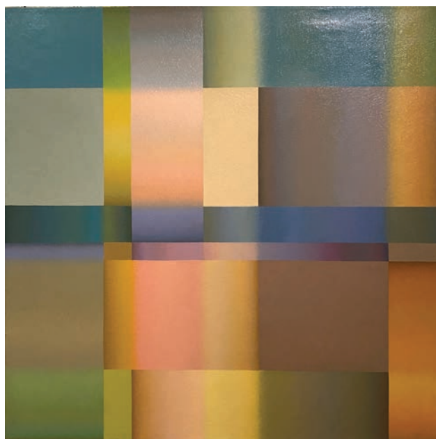
Lula Mae Blocton Summer Ease 1975

George Bellows American, 1882–1925 The Life Class, No. 2 1919 Lithograph on wove paper Museum Purchase with funds provided by Don and Tekla Shackelford in honor of the new Bellows Study Center