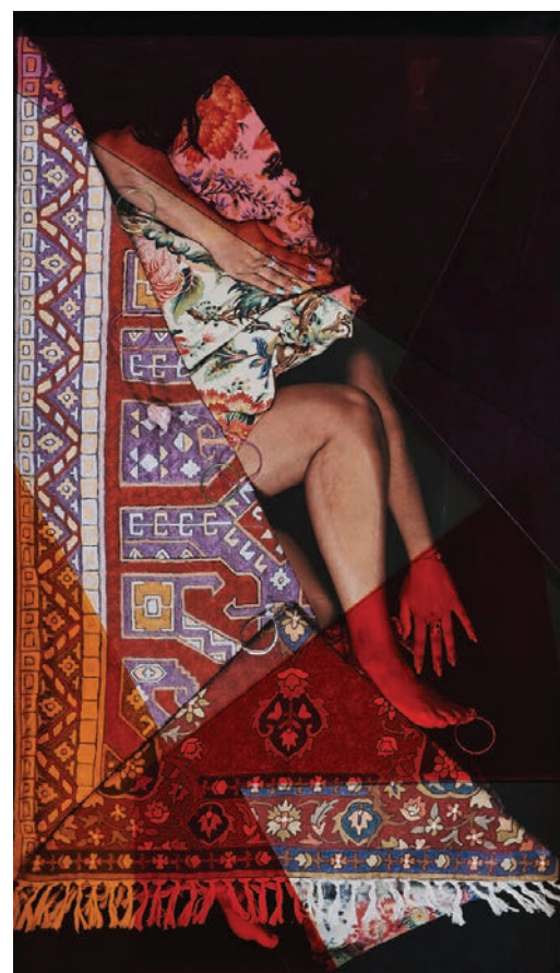
Baseera Khan I Arrive in Place with a High Level of Psychic Distress (Pink) 2021

Anthony Pearson American, born 1969 Untitled (Etched Plaster) 2014 Hydrocal® in lacquer-coated maple frame Gift from a Private Collection