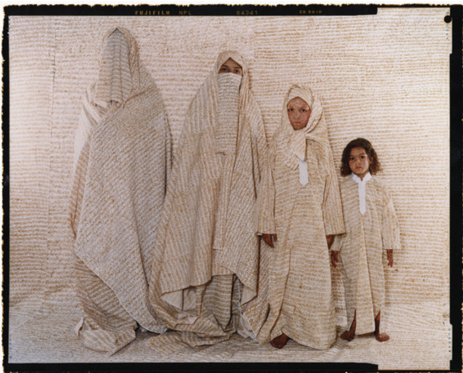
Lalla Essaydi Converging Territories #30 2004