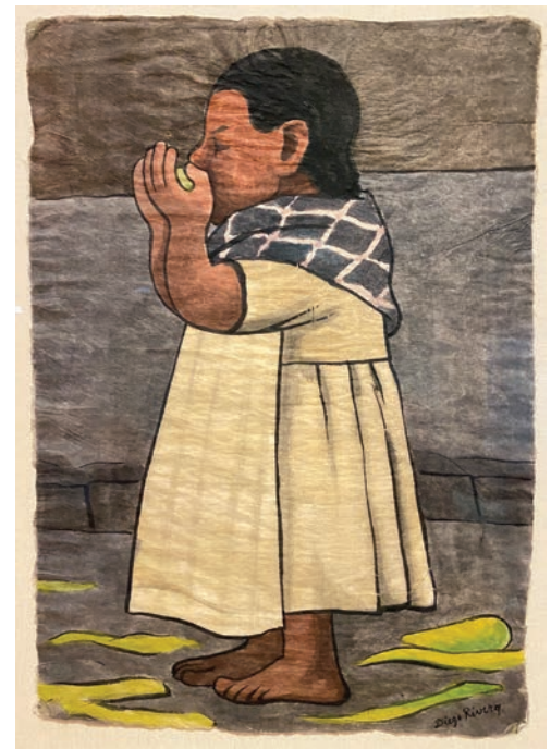
Diego Rivera Girl Eating a Cake 1938